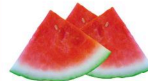
Local & Organic Watermelon