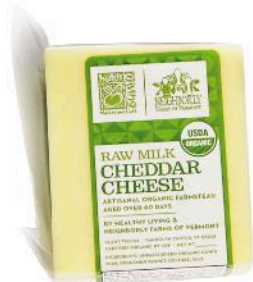
Neighborly Farms Organic Raw Milk Cheddar Reg price $12.99

Wine Pairing: Belle Glos Pinot, of course!