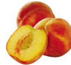
Eco Grown or Conventional Yellow Peaches Reg price $2.29