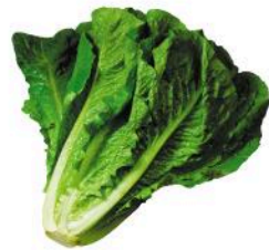
Local & Organic Romaine Lettuce Reg price $2.69

Our shelves and coolers are bursting with produce grown locally by the talented and dedicated farmers we love. Since the mid 80's we've been partnering with local farms, getting to know farmers, and working hard to help bring the bounty to market. It's been a long process, and worth it every minute because what's grown locally is really the best and we are so fortunate to live in areas surrounded by wonderful farms. Remember to thank your farmers next time you see them.