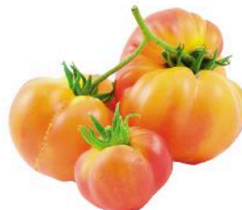
Organic Heirloom Tomatoes